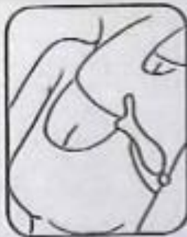
Tighten Flabby Arms