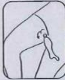
Tighten Inner Thigh